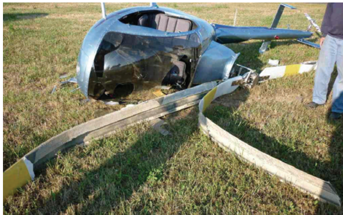
July 15, 2009

To date, the FAA inspector has agreed that the accident was probably caused by one of the rotor blades delaminating which caused a "hard-over". The NTSB has not yet investigated.