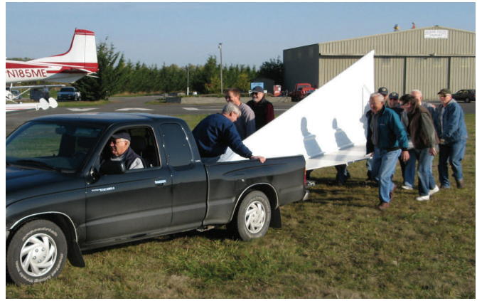
Many hands and a few good tires