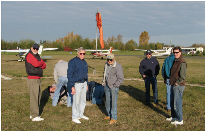
Gary's hard-working crew