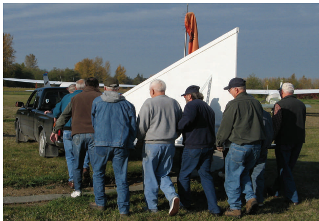
Follow that truck!