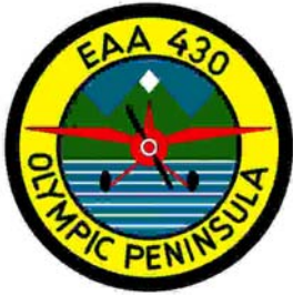
Volume 5 Issue 5