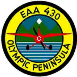
Volume 5 Issue 6